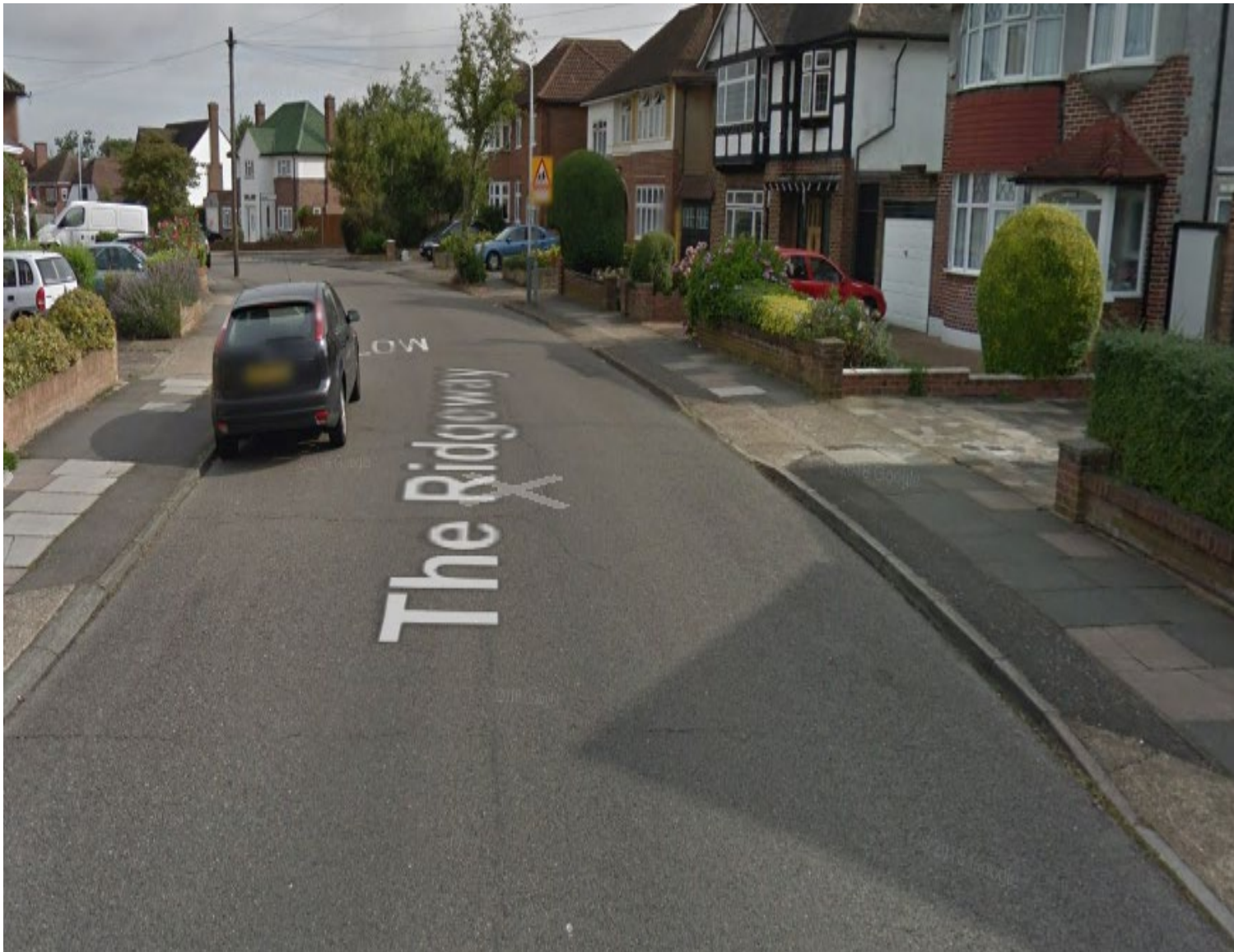
The Ridgeway – before FW works