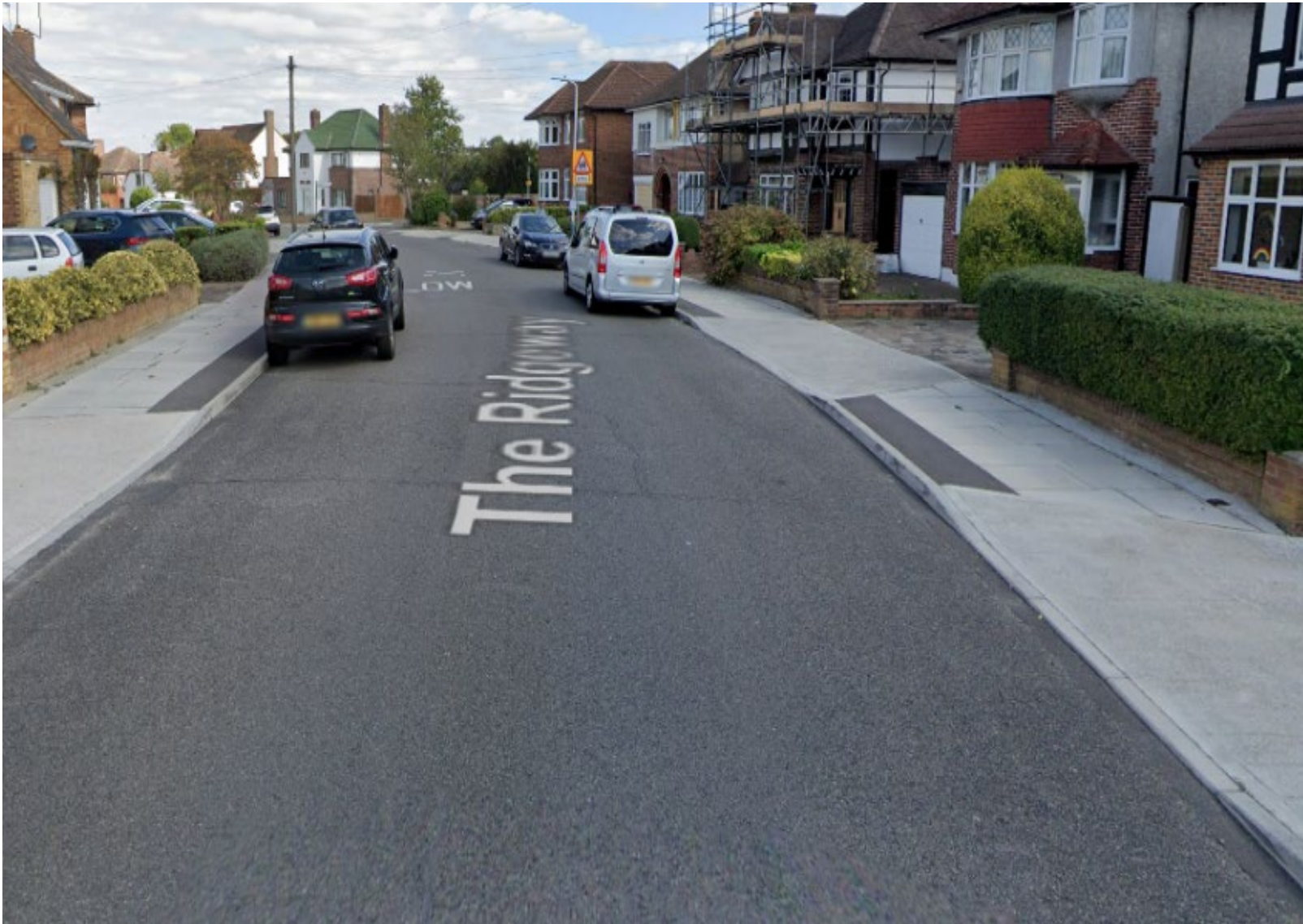
The Ridgeway – after FW works