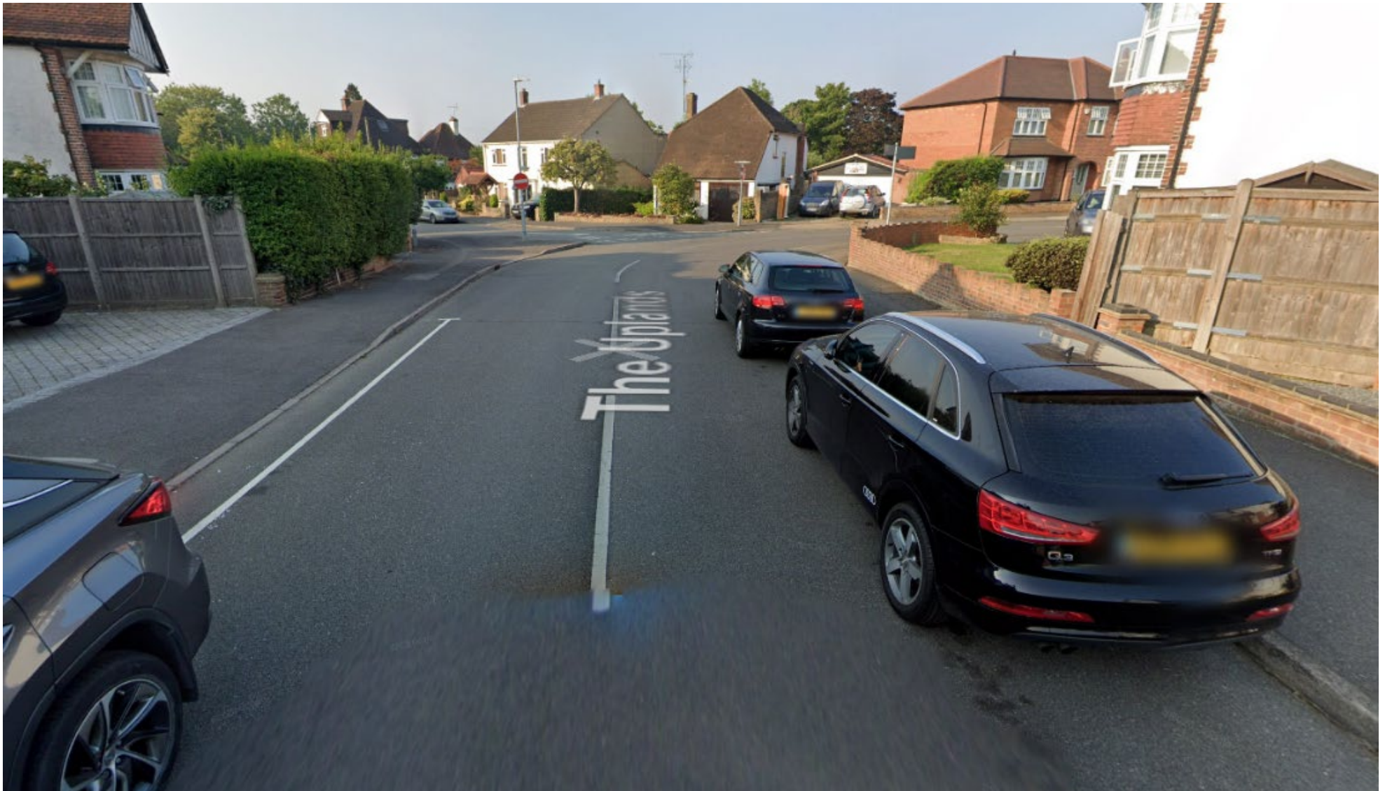
The Uplands – showing existing footways surface